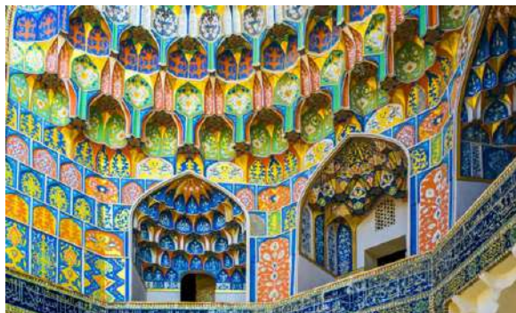
Masterpiece of the Islamic art and Quran calligraphy in the Abdulaziz-Khan Madrasah in Bukhara, Uzbekistan