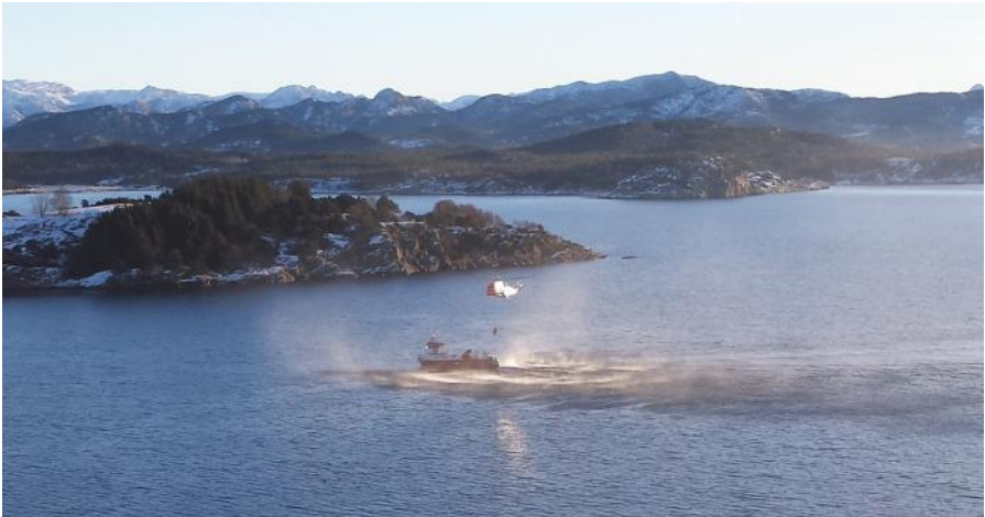
Man being winched off ship in Gandsfjord, Stavanger in Norway, right opposite the window of Brian and Christina Greathead's flat.